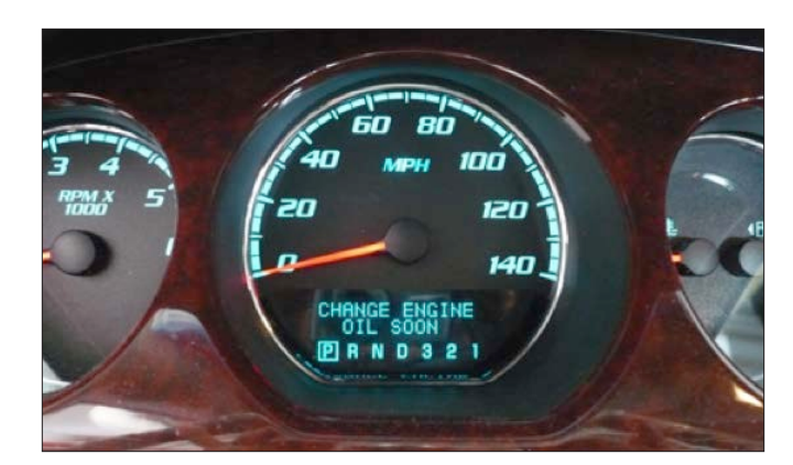
An in-car maintenance reminder alert.

Proper maintenance has always been critical to ensuring automobile safety, reliability and longevity. Over the years, reminders to perform necessary vehicle maintenance have been provided in owners' manuals and maintenance booklets, on stickers