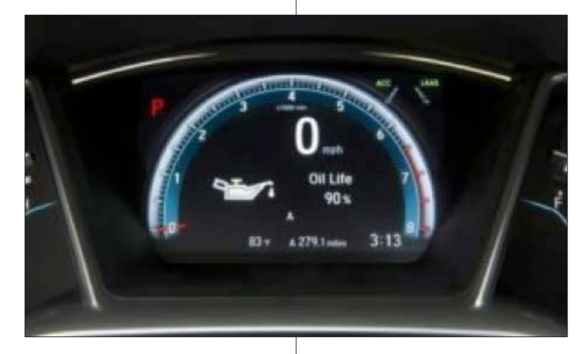
A maintenance reminder system that displays remaining oil life.

Most maintenance reminder systems display a warning light or text message when the engine is first started as an indicator of proper system operation. During normal driving, some reminder systems can display the remaining oil life on request, but others are invisible until they announce the need for service.