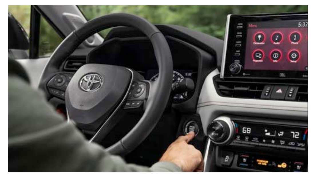
A maintenance reminder reset on this Toyota requires pressing the ignition and trip meter buttons in a specific sequence.

following the instructions precisely. Before attempting a reminder reset, read the directions thoroughly, have a full understanding of all steps in the process and make sure any preconditions (such as having the car doors, hood and trunk closed) have been met. In addition to the owner's manual, reminder system reset procedures can be found in YouTube videos, on websites such as <a href="https://www.oilreset.com">www.oilreset.com</a>, and via mobile apps such as Oil Reset Pro, Reset Oil Service Pro and others.